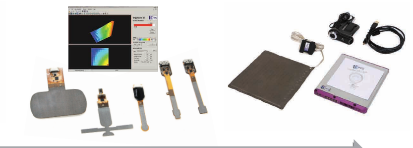
Increasing Cost and Complexity

TactArray - Flexible pressure sensing pad designed to capture contact pressure distribution